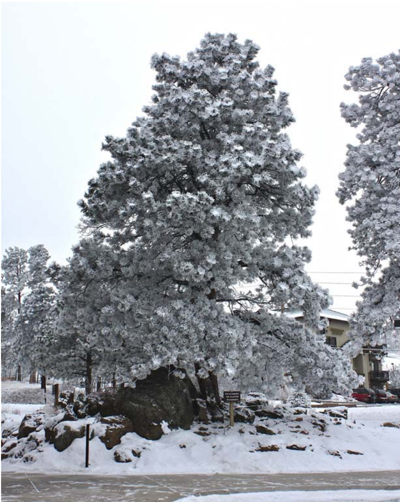
Ponderosa pine next to FTC building covered with frost the day of the March meeting

To make one pound of honey, bees must tap 2 million flowers.