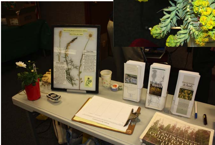
Noxious weed display for weeds of the northern front range