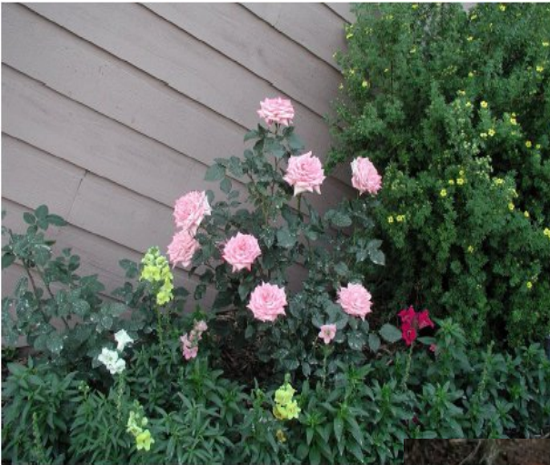
Above: photo from 2003, name unknown