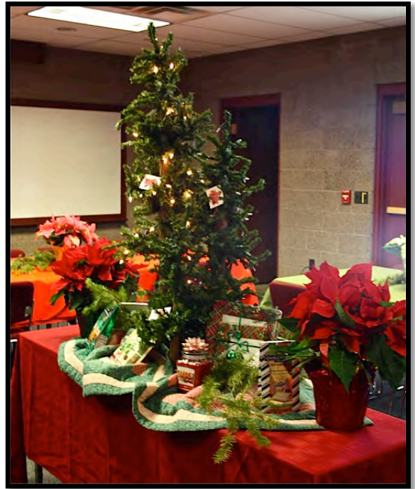
The prize table Christmas tree. Looks beautiful.